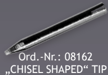
Ord.-Nr.: 08162 „CHISEL SHAPED“ TIP