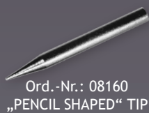
Ord.-Nr.: 08160 „PENCIL SHAPED“ TIP