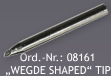
Ord.-Nr.: 08161 „WEGDE SHAPED“ TIP