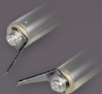
Ord.-Nr.: 21431 2 MM TIPS