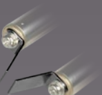
Ord.-Nr.: 21433 8 MM TIPS