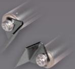
Ord.-Nr.: 21435 16 MM TIPS