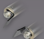
Ord.-Nr.: 21434 10 MM TIPS