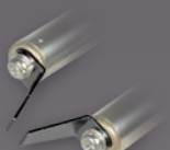
Ord.-Nr.: 21432 5 MM TIPS