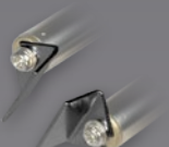
Ord.-Nr.: 21436 20 MM TIPS