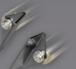
Ord.-Nr.: 21437 30 MM TIPS